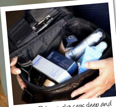
The TV journalist says sleep and water are the best beauty treatments.

Chanel No. 5 EDP, $159 (50ml). It's a classic. NI